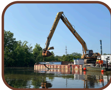
Placement of woody debris along the shoreline to increase habitat diversity at Phoenix Lake