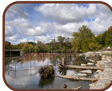
Shoreline stabilization, habitat logs and aquatic plantings at Wilcox Lake