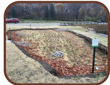
Bioswale installed with native plants to reduce direct non-point source pollution at Wilcox Lake